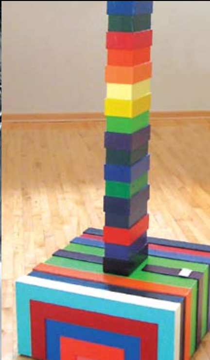
Faculty & Staff Exhibit David Kastner: Color Column

The Art Gallery was established in 2006 during a major renovation of the Alric C. T. Pottberg Library on the West Campus in New Port Richey. Designed to maximize the beauty of displayed works of art, natural light floods the 1,000-square-foot area and professional track and spot lighting optimally displays each exhibit.